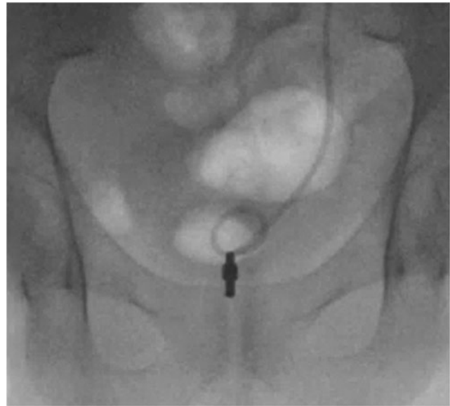
FIG. 3. First case: connecting magnets under fluoroscopic control.

According to the manufacturer of both stents (Urotech, Achenmühle, Germany), the costs of the regular stent are 20 Euro (€), including guidewire and pusher, whereas the magnetic DJ costs about € 80, including the retrieval device.