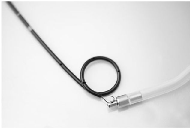
FIG. 1. Magnets on retrieval device and DJ (Blackstar, Urotech (Achenmühle, Germany)).

functional efficacy of a newly developed DJ stent, which allows for removal without cystoscopy. The impact on patient's quality of life regarding stent- and stent-removal-related symptoms, as well as the DJ removal, was especially addressed.